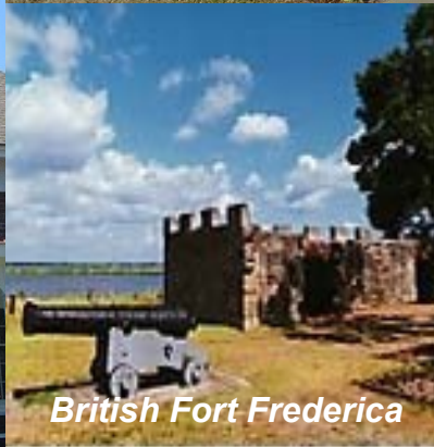
British Fort Frederica