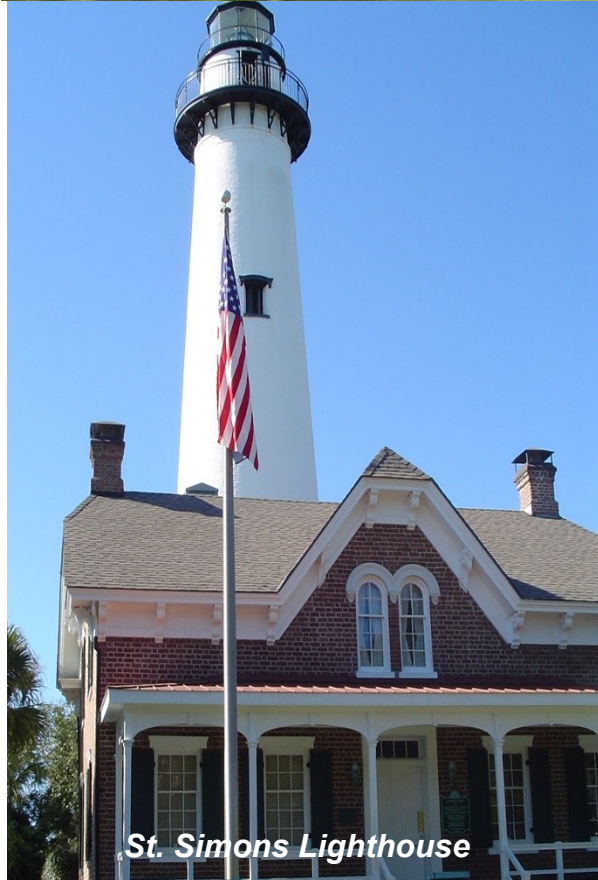
St. Simons Lighthouse