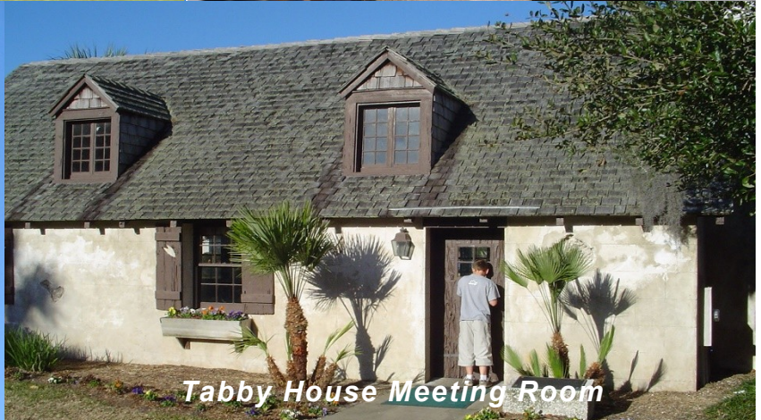
Tabby House Meeting Room